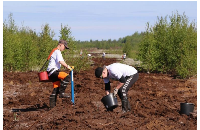
Young planters participating in Seedling Action

The idea of Seedling Action came originally from a private company, Best-Caravan Ltd., who contacted the Finnish 4H-Federation and wanted to compensate for the carbon dioxide emissions caused by the company. The company made accurate carbon dioxide calculations with the help of Natural Resources Institute Finland to estimate how many hectares of new forest should be planted each year in order to compensate for the emissions.