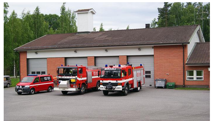
The fire station of Anttola contract fire brigade, a typical village fire station.

Contract fire brigades have proven suitable and effective in wildfire fighting. This is due to the fact that the destination from rural fire stations to wildfires is much shorter when compared to nearest city. The local firemen also often know the area well, which helps the access to area and firefighting. The fast response to alarm and rapid access enable that wildfires can be caught, limited and extinguished quickly which mostly prevents the escalation into a larger fire.