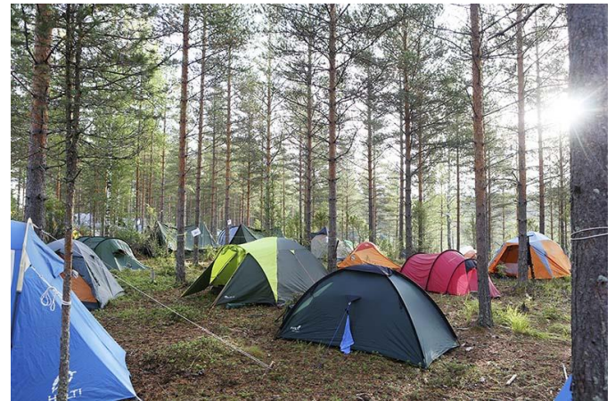
Evo Camping Centre hosts large domestic and international scout camps frequently

The Evo area also hosts a special Evo Camping Centre that offers an excellent setting with permanent structures for organising large or small camps and events. The versatile camping centre is particularly well suited to camping events organised by scouts and other parties thanks to its transport connections, the services in the area and the natural conditions. The camping centre can be booked all year round.